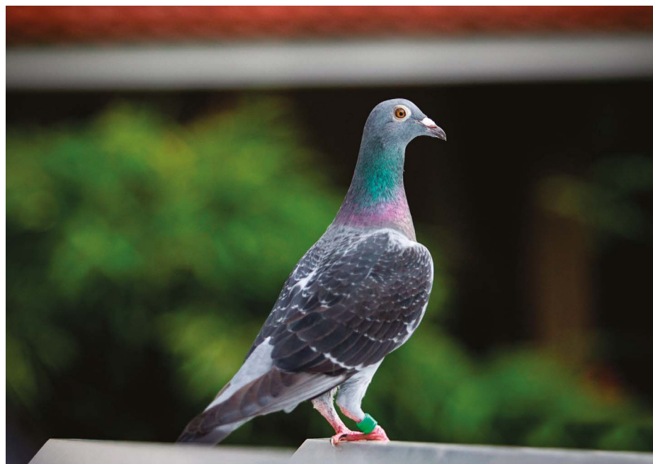
Studies show that several animals can sense the direction and strength of magnetic fields.